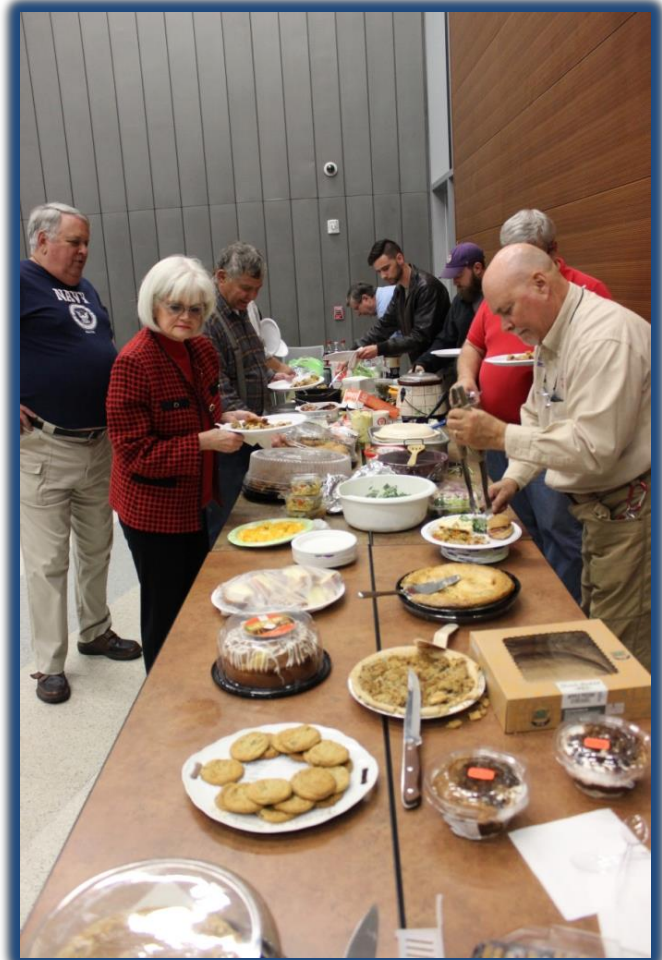
The Buffet Feast