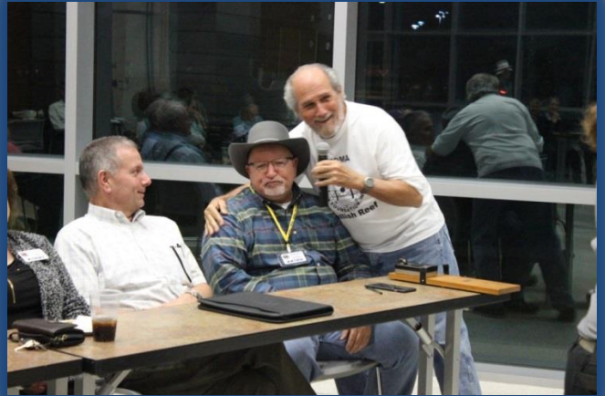
Sometimes a Little Persuasion is Needed