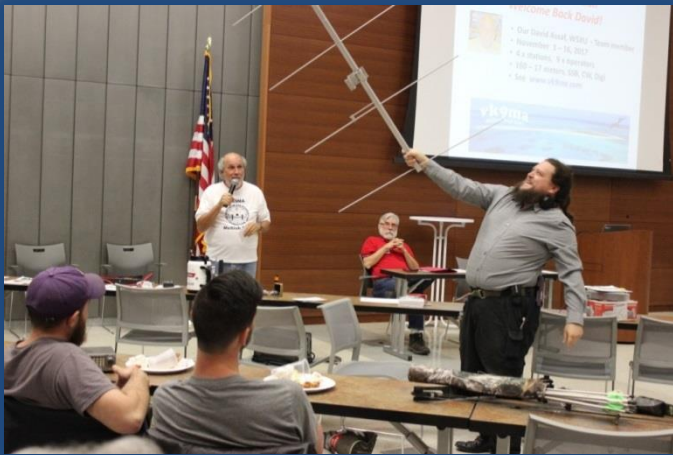
"Can you hear me now?"