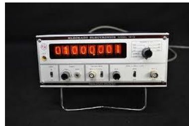
Eldorado Frequency Counter

The last test instrument is a RF frequency counter. It is an Eldorado Electronics 1615K1Y2-14 frequency counter. A frequency counter usually measures the number of oscillations or pulses per second in a periodic electronic signal.