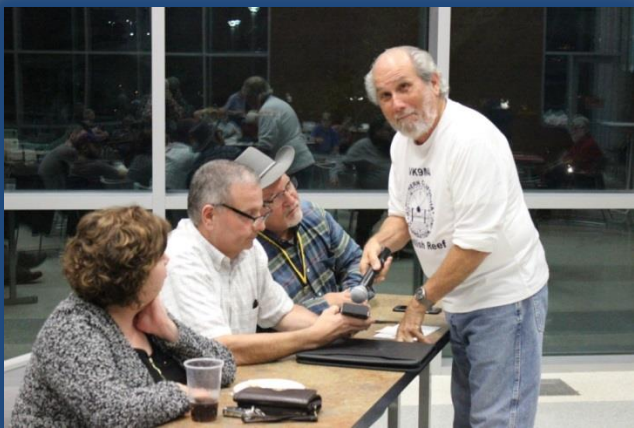
Serious Negotiations Over a Code Tutor