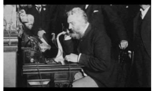
and moments later he was notified that his car's extended warranty had expired.