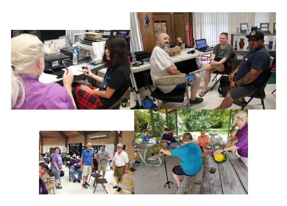
LAST BUT NOT LEAST THE CELEBATORY WATERMELLON.