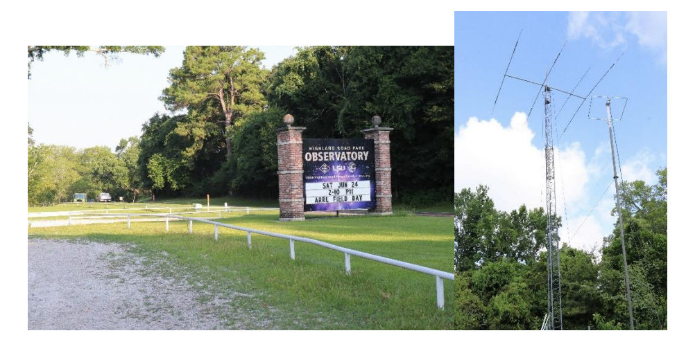
The 2023 Field day was a success. As you can see from the photos, we had quite a crew. Thanks to all who participated.