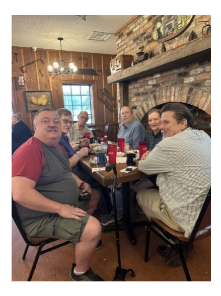
(Look at those mugs.)