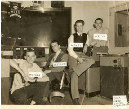
WJBO Control Room

All activities moved to the Naval Reserve Headquarters in early 1941. After the start of WWII, Congress suspended all amateur radio operations and many of the younger hams were called to active duty as radio operators. In June 1942, at the insistence of the American Radio Relay League, the US government created the War Emergency Radio Service (WERS) WERS was a precursor to the civil defense and Radio Amateur Civil Emergency Service (RACES ) groups and it which would remain active through 1945. WERS provided communications in connection with air raid protection, and communications during times of natural disaster. WERS licenses were given to communities and not individuals.